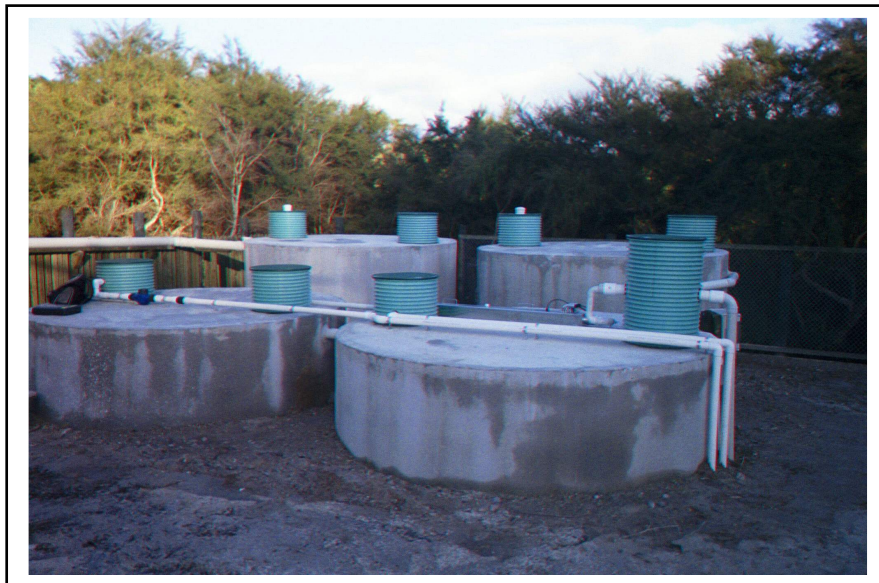
Figure 2. Photo showing the rtPBR treatment tanks