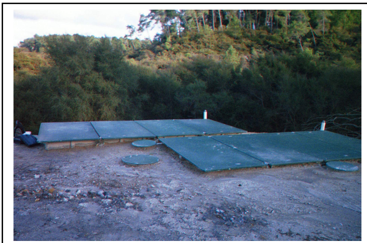
Figure 3. Photo showing the rtPBR treatment system.