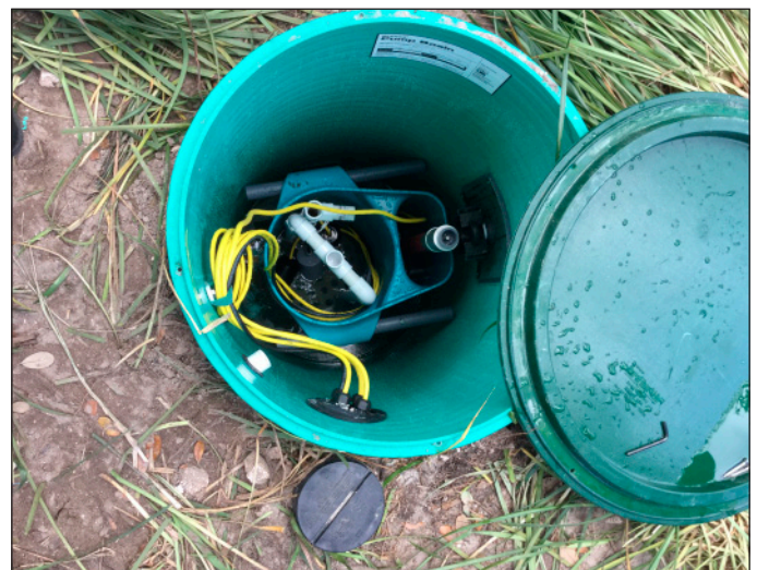
The city owns and operates the entire effluent sewer infrastructure, including the on-lot tank and pump package at each home.