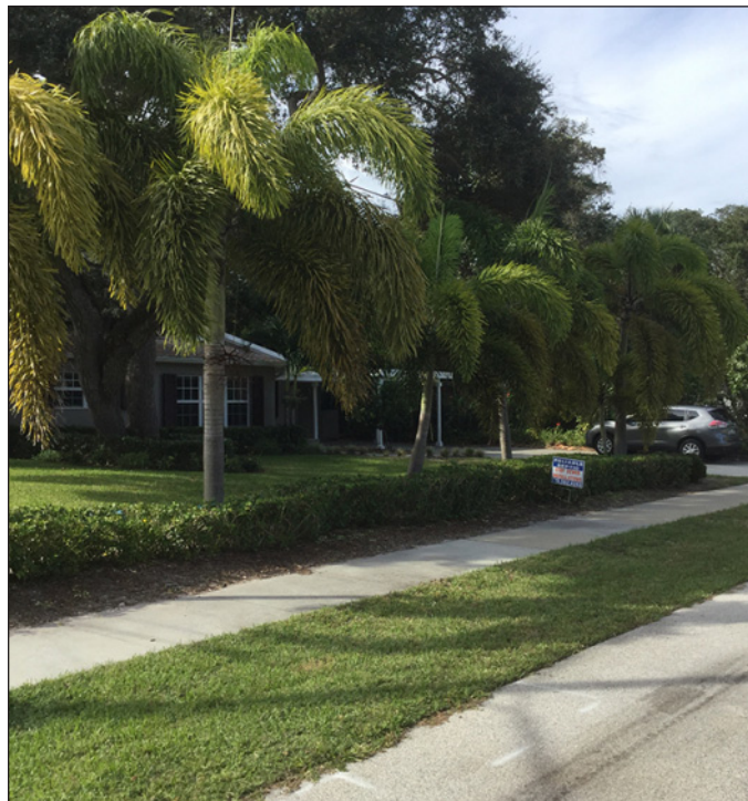
Further extending gravity sewer was too expensive and disruptive due to the small lots and mature trees common throughout Vero Beach.

The dramatically lower cost of an Orenco Effluent Sewer is largely attributed to its use of small-diameter mainlines laid at a constant depth to follow the con-