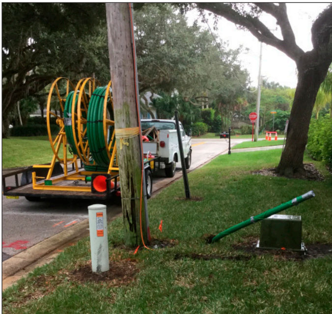
Orenco Effluent Sewers’ affordability stems primarily from their use of small-diameter mainlines, which can be installed with minimal disturbance to neighborhoods.

When constructing a gravity sewer in an existing, active street, prolonged and inconvenient traffic delays are likely to occur. This is not the case with effluent sewer, for which mainlines can typically be installed along the side of the road with light-duty equipment. Due to gravity sewer’s larger construction footprint, road and landscape restoration costs are also more expensive when compared to those associated with effluent sewer. With regards to gravity sewer, “Depending upon soil conditions, either a portion of the roadway or the entire roadway may be removed during the trenching operation. In some cases, where only a portion of the roadway is removed for sanitary [gravity] sewer installation, the