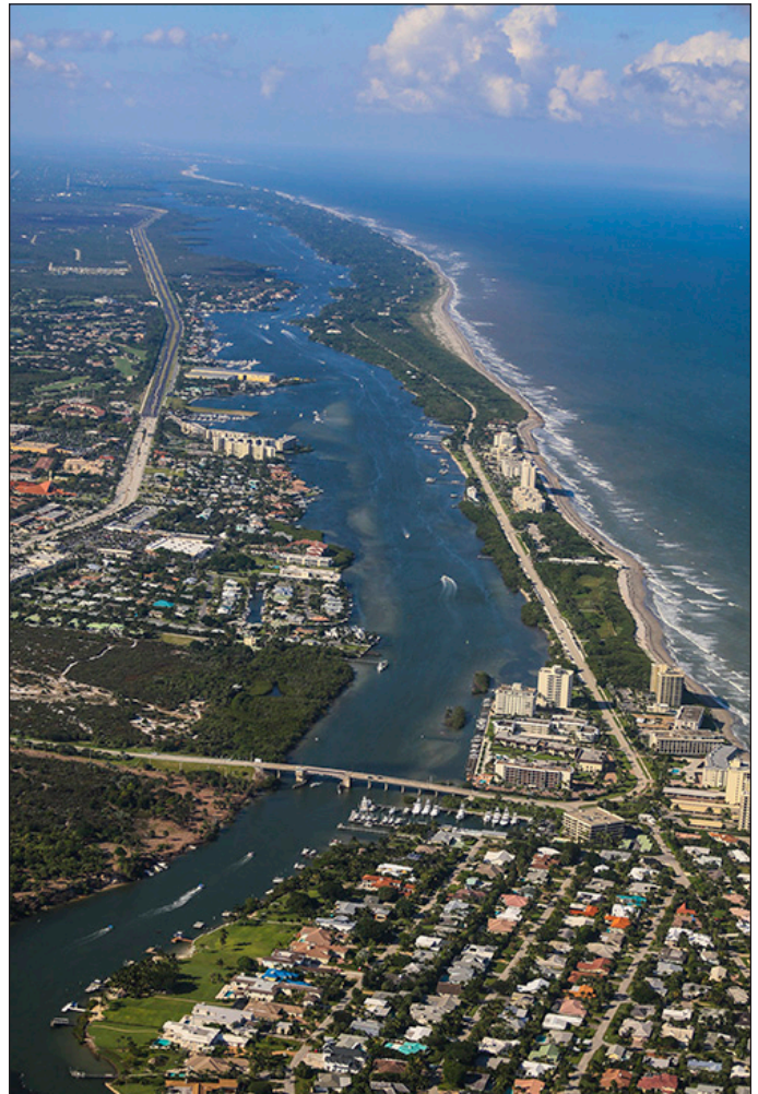
The total cost of installing an Orenco Effluent Sewer in Vero Beach was estimated to be half the cost of expanding the city's gravity sewer.

The first 2-inch (50-mm) collection lines and on-lot STEP packages were installed in the spring of 2015. A total of 1,500 residences are expected to opt in before the project is complete. The majority of homes will have a new, watertight 1,000-gallon (3,800-L) tank and STEP package installed at an estimated cost of $7,000 (installation plus materials) per connection. However, if a home was recently constructed and the city deems the existing septic tank to be watertight and structurally sound, the tank will be retained and the cost of construction will be reduced to about $5,600. In this case, the on-lot component design includes a simple, 100-gallon (380-L) pump chamber installed immediately following the existing tank (see photo at right). Once connected to the Orenco Effluent Sewer system, primary-treated effluent from each