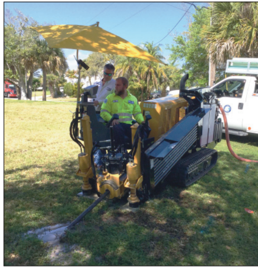
Trenchless construction is a less-intrusive method for installing new pipes while reducing negative environmental impacts and disruption to residents.

In Vero Beach, the minimal construction impact of the new Orenco Effluent Sewer was appreciated, especially considering that a significant percentage of the city’s residential lots are located on narrow streets and contain large homes surrounded by mature and established live oak trees. In fact, a substantial number of homes that are expected to connect to the system are located on lots of 0.3 acres (.12 ha) or less. Table 1 shows lot size data for the Bethel Creek area, which is representative of the city.