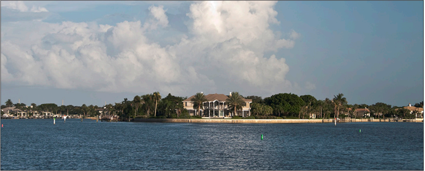
Connecting an estimated 1,500 residences to the city's new Orenco Effluent Sewer should dramatically improve water quality in the lagoon.

home's on-lot STEP package is pumped to the city's central wastewater treatment facility.