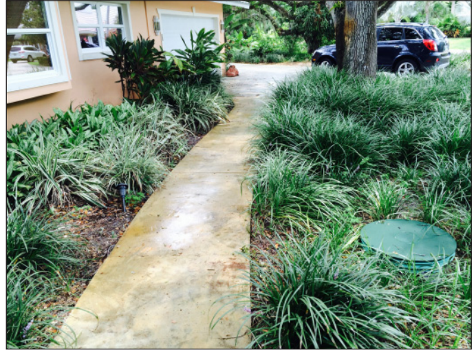
Each home connected to the system has an Orenco STEP package, including a 1,000-gal (3.8-m 3 ) watertight tank and an energy-efficient, low-horsepower pump that conveys effluent to the treatment plant.

According to Bolton, the installation time required for an effluent sewer system is less than a quarter of that required for a conventional gravity sewer. Directional boring (generally not possible for gravity sewer installations) was used in Vero Beach to minimize the impact of construction on both the public and the environment. This less-intrusive construction method reduces a number of unfavorable by-products of the construction process, including adverse environmental impacts, permitting concerns, problems with handling and disposing of excavated soils and groundwater,