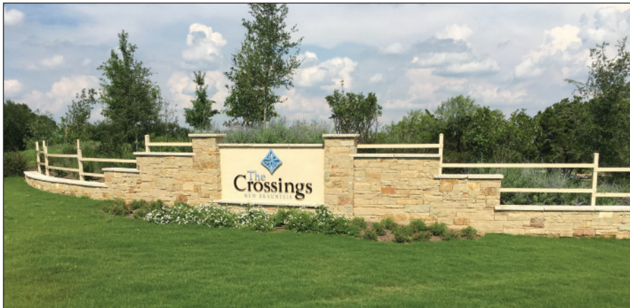
Beyond the reach of any existing sewer system, this new subdivision needed cost-effective wastewater collection and treatment that could be installed in phases.

Solution Due to their “phase-ability” and affordability, developers chose an Orenco® Sewer™ and an AdvanTex® Municipal Treatment Facility. Both collection and treatment can be installed in phases, dramatically reducing up-front capital costs and offering homeowners a fully sewered community.