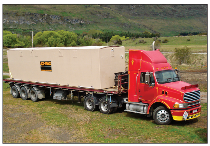
Completely pre-packaged and built inside a durable, insulated, fiberglass tank, an AX-Max<sup>™</sup> unit is easy to ship—either by truck, rail, or cargo container.

Even though each of the park's bathroom and shower facilities had its own septic tank, the tanks were quite old and many of them were too small to meet current levels of usage. During the peak summer season, several of the tanks would routinely fail, and effluent would overflow the trenches. Bad odours were common, as was the need for pump-outs.