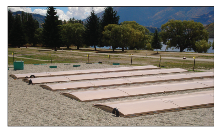
The facility features five Orenco® AX-Max units that employ the AdvanTex® recirculating media filter technology. AdvanTex units produce high-quality effluent with substantial reduction of nutrients, making them well-suited for any project with strict discharge limits.

Total project cost was NZD $1,322,000 + GST (Goods and Services Tax) ... just a little more than $1 million in U.S. dollars. The project involved replacing all but one of the campground's existing septic tanks, as well as linking the new interceptor tanks to an Orenco effluent sewer, which transports the liquid effluent to a central wastewater treatment