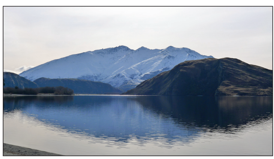
Glendhu Bay Holiday Park is situated on the shores of beautiful Lake Wanaka, New Zealand's fourth largest lake. The park has 400 campsites and lodging for 60.

Although Wanaka, New Zealand might rightly be called a winter vacation destination, it also boasts many year-round activities, such as skydiving, hiking, fishing, and camping. Among the convenient camping