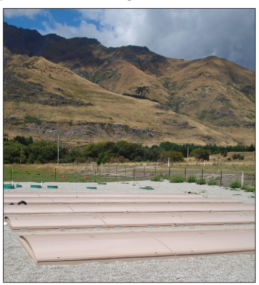
Whether installed above or below the ground, the sand-colored AX-Max units emit no odor or sound and thus draw no attention from passersby.

While enjoying the natural beauty of the area, Glendhu Bay's many visitors appreciate the conveniences of the campground facilities without ever being aware of the sophisticated wastewater system that makes it all possible. And that is just the way it should be.