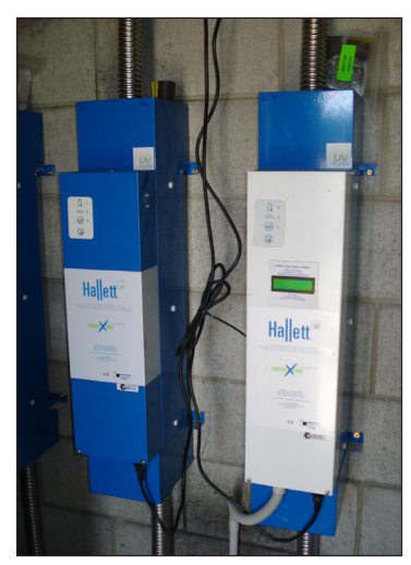
Hallett disinfection units for tertiary treatment.

For tertiary treatment, a fifth AX-Max is used as a polishing unit, followed by ultraviolet disinfection and land treatment (dispersal) with subsurface pressurized distribution lines.