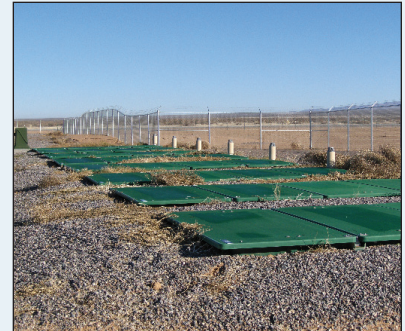
Eight AX100 pods treat widely-varying flows up to 30,000 gpd.