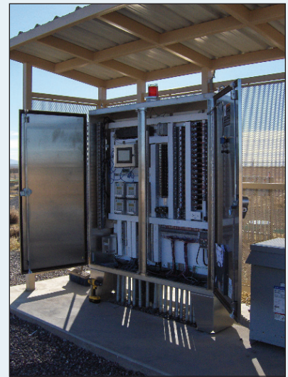
The wastewater system is controlled by an Orenco TCOM™ custom control panel.

For more information about Orenco Effluent Sewers and AdvanTex® Treatment Systems, contact Orenco Systems®, Inc., at 800-348-9843.