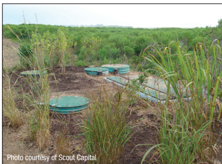
An AdvanTex® Treatment System, manufactured by Orenco, nestles discreetly in the beach grass. This low-energy, highly reliable media filter replaced the former cesspool and treats this Esther's Island household's wastewater to re-use quality.