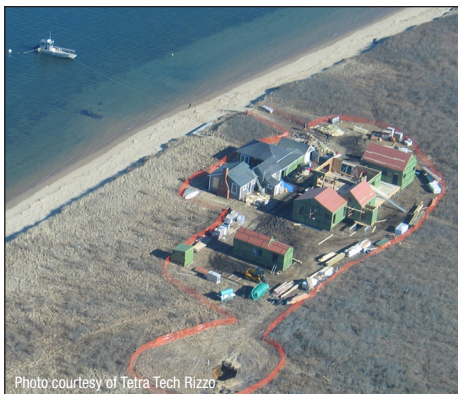
This aerial view of the Esther's Island construction site shows the protective fencing around the project perimeter and the green Orenco fiberglass tank, lying on its side, in the foreground.

were poured around the tank, treatment pod, and pump basin to keep them firmly in place. Field Service Manager Dave Mead installed the system and tests it regularly. "It's running great," said Mead. His last sample showed excellent treatment, with BOD 5 of 6 mg/L, TSS of 5 mg/L, and TN of 7.8 mg/L. By comparison, conventional sewers are allowed to discharge municipal wastewater with contaminant levels that are six times higher — and worse.