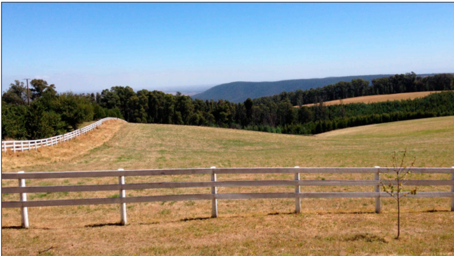
The community of Kinglake West, Victoria, is home to Australia's first Orenco® Sewer, installed in 2010. The cost of this effluent-only sewer was estimated at less than half that of a gravity sewer.

In early 2009, a record-breaking heat wave struck the state of Victoria in southeast Australia, making already dry conditions even worse. In addition, strong winds and low humidity combined to create some of the highest-risk fire conditions ever experienced in the region. Fierce winds knocked down power lines, resulting in fires that quickly grew into the largest, most destructive firestorm in Australia's modern history.