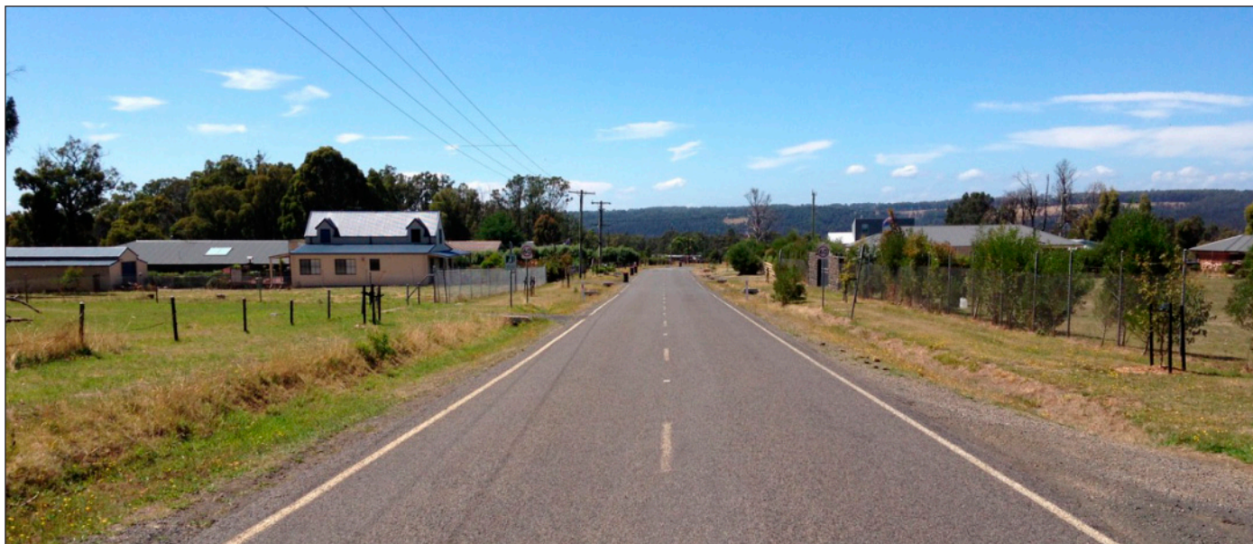
An effluent sewer uses shallowly buried, small-diameter collection lines that are quickly installed along roadsides with light-duty equipment. That means minimal disturbance to the surrounding neighborhood and no need for road repairs following installation.

The community of Kinglake West, home to about 1,000 residents, was dramatically impacted. Much of the town needed to be rebuilt, including its infrastructure. In particular, the community needed a collection system to transport wastewater from individual homes to a decentralized wastewater treatment plant.