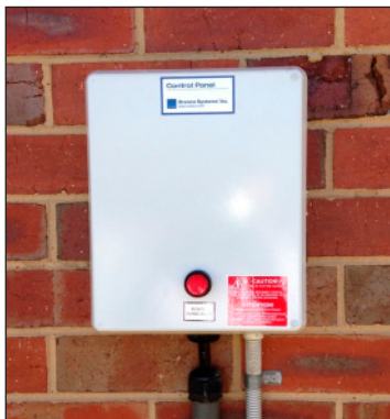
A programmable control panel at each home monitors the components of the on-lot STEP package.