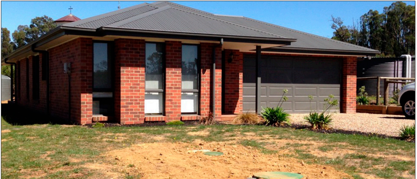
Each home received an Orenco STEP package, which includes a buried, watertight tank. Naturally-occurring bacteria in the on-lot tank passively digest organic solids, making it possible to significantly reduce the size and cost of the treatment facility.

enough that Yarra Valley Water could have used it to pay for the installation of an effluent sewer for an entire second community of the same size.