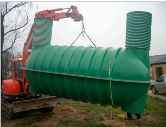
Undigested solids accumulate slowly in the on-lot tank, so pump-outs are typically needed only once every ten years.