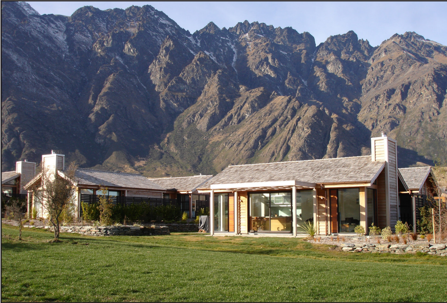
Using a liquid-only sewer at Jack's Point has reduced upfront capital expenses, because on-lot tanks are installed only as each home is built.

The three treatment systems are being upgraded one by one to enhance nutrient reduction. In 2017, facility #3 serving N5/6/7 was the first to be upgraded, and the details are shown in the sidebar at right.