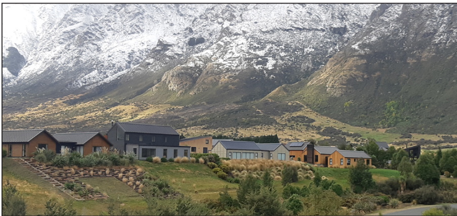
The developers of Jack's Point envisioned a subdivision of 900 luxury homes. They needed an affordable wastewater collection system that could handle variable terrain, followed by a reliable treatment system that would produce high-quality effluent and could be installed in stages.

At the time of its conception in 2002, Jack's Point subdivision was set to become the largest planned residential community in New Zealand, with developers envisioning approximately 900 luxury homes. The selected location was just outside Queenstown, a resort community on the shores of Lake Wakatipu with a view of the snow-capped Southern Alps.