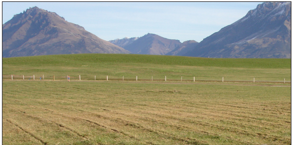
Treated effluent is dispersed through subsurface, pressure-compensating driplines into irrigation fields. The Resource Consent requires the effluent to meet strict requirements.

The community is roughly divided into seven neighborhoods (N1-N7). The clubhouse has a 9000-L (2400-gallon) on-lot tank, while each house has a 3800-L (1000-gallon) tank. Primary-treated effluent is pumped from these tanks through small-diameter, liquid-only sewer lines to one of the subdivision's three AdvanTex wastewater treatment facilities. Treated effluent is dispersed through subsurface, pressure-compensating driplines into the irrigation fields.