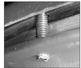
Close-up views of stainless steel self-tapping screw in Ultra-Rib riser